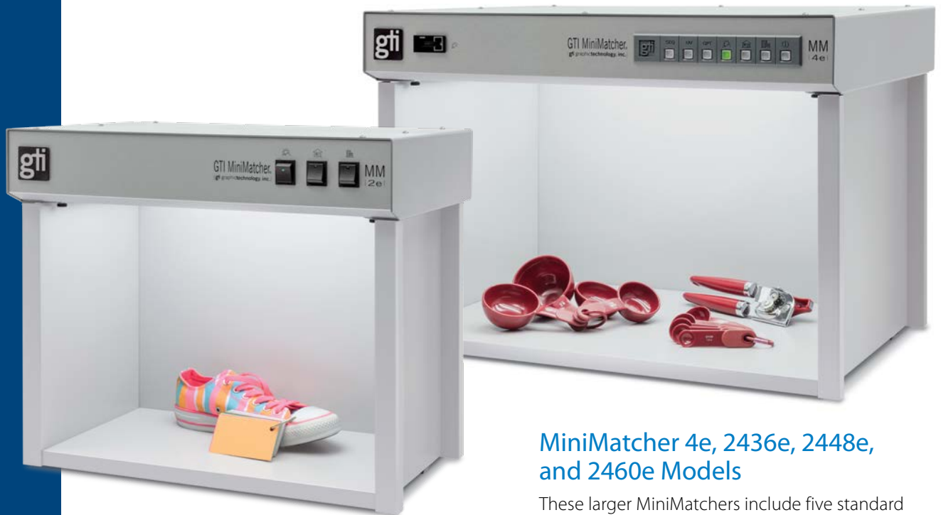
MiniMatcher MM-2e (left) and MM-4e (right)

Affordable Tabletop Color Matching and Inspection Systems