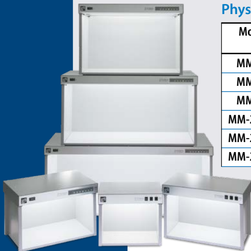
From top down: MM-2436e, MM-2448e, MM-2460e Bottom row left to right: MM-4e, MM-2e, MM-1e

GTI is a leading manufacturer of tight tolerance lighting systems for critical color viewing, color communication, and color matching. An in-house spectroradiometric laboratory and a 100% measurement and verification production process guarantees that precision and accuracy is built into all products. All products are shipped with a certificate of product conformance (NIST traceable).